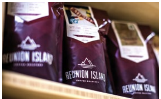
Newly designed retail packaging.

Reunion Island also is investing in the future of coffee quality in the region through its Los Jovenes del Café program. The program aims to keep local youth in coffee farming by purchasing 1-hectare plots of land and seedlings for promising children of coffee growers. The young farmers are trained to plant and care for coffee, and when they