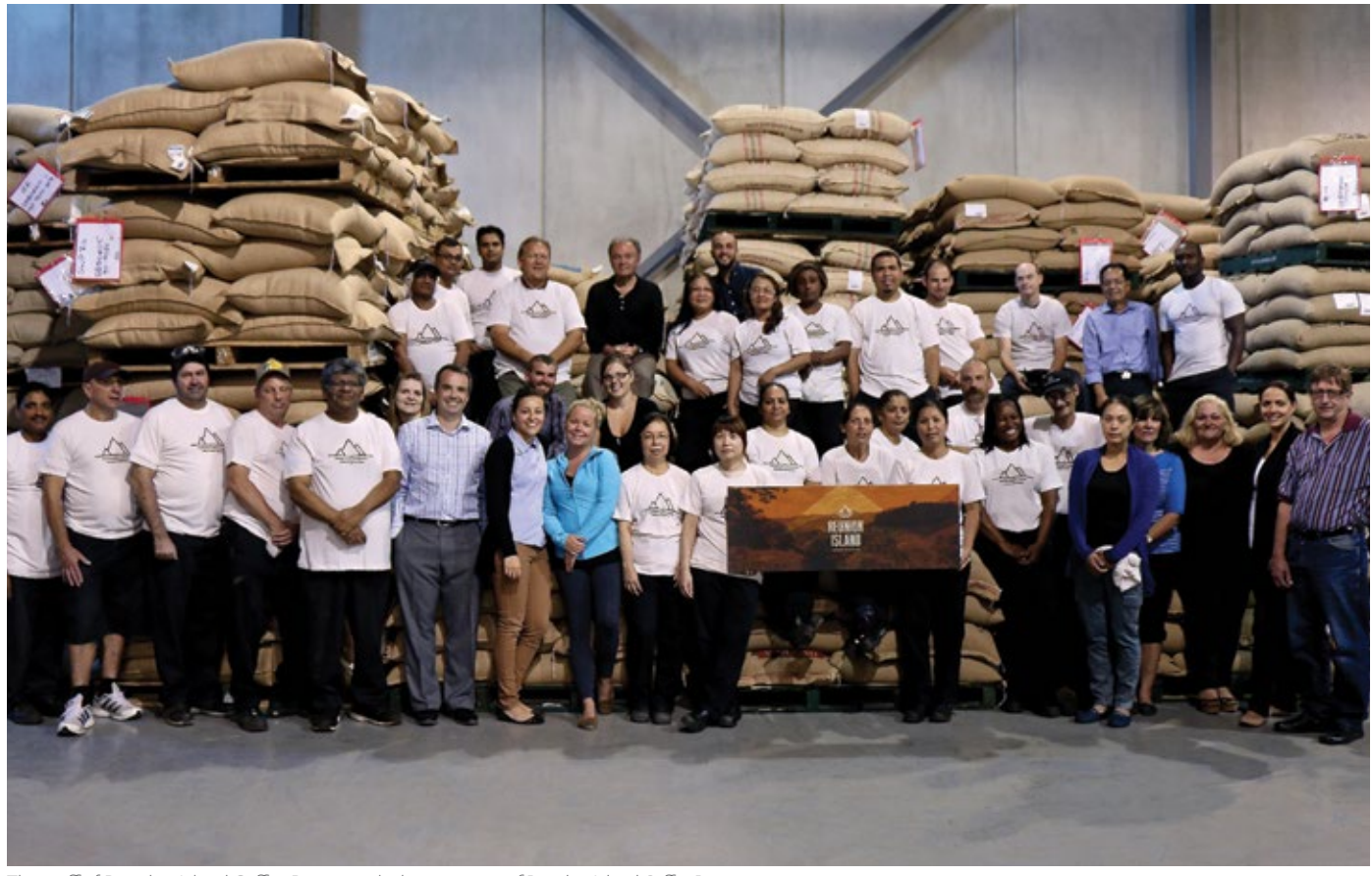
The staff of Reunion Island Coffee Roasters.